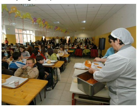
" Type C " if cooked meals are placed in mono-portion containers ready for the individual consumption

"Type B" if cooked meals are placed in multi-portion containers, to maintain the correct temperature during transport to school and portioned at the time of consumption (inside the kitchens just the first "dry" dishes are prepared – pasta, rice, dumplings, etc.)